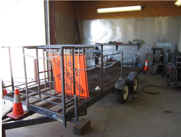
New Barricade/sign trailer in progress