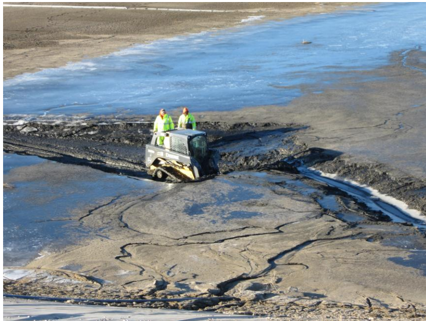
Digging path through soils in the reservoir to transport pipefittings to the outfall pipe