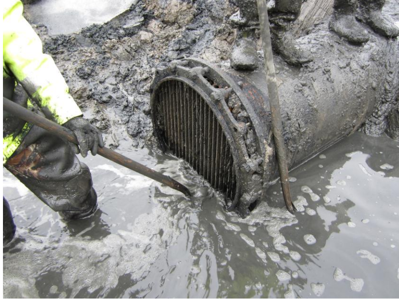
Directing slurry from reservoir to outfall pipe for disposal into drying beds